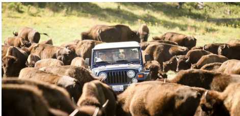
A different world