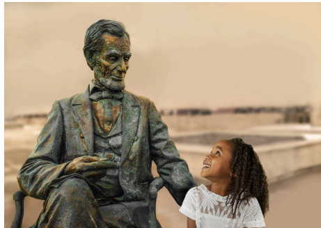
Hanging with the presidents